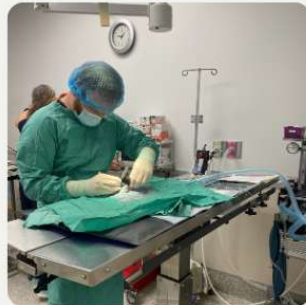
Veterinary care in the OHS Clinic