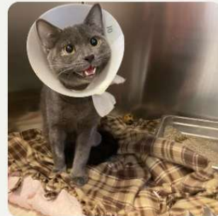
Sheltering and daily care