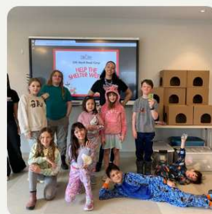
Humane education and dog training