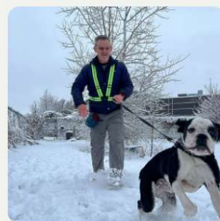
Foster and Volunteering