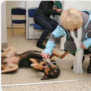
Municipal Animal Shelter