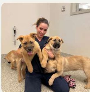
Behaviour support and enrichment