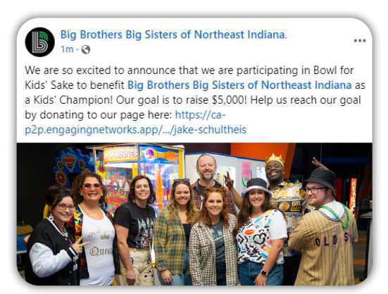
Example of your post on Facebook

Share content through photos, videos, and graphics - anything that makes your audience want to check out your fundraising page. The possibilities are endless!