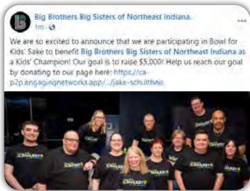
Example of your post on Facebook