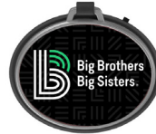
Raise $1,500 Big Brothers Big Sisters CanCan Bluetooth Speaker