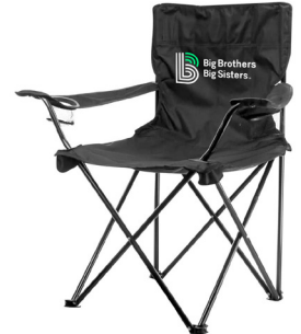
Raise $2,500 Big Brothers Big Sisters Tailgate Chair with Case