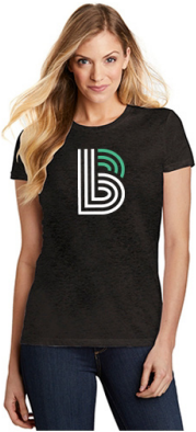
Raise $100 Big Brothers Big Sisters T-Shirt