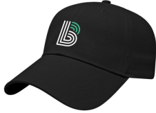
Raise $250 Big Brothers Big Sisters Ball Cap