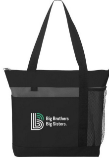
Raise $500 Big Brothers Big Sisters On The Go Tote